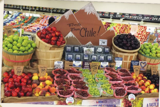
Fresh fruit from market in Chile