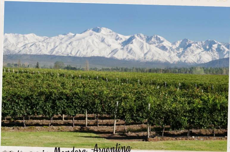
Winery in Mendoza, Argentina