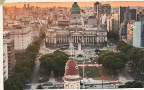
Buenos Aires, Argentina