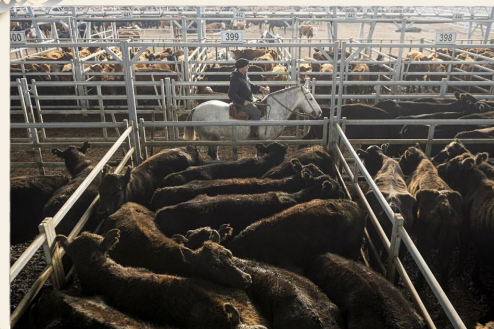
Nuevo Mercado Agroganadero livestock auction